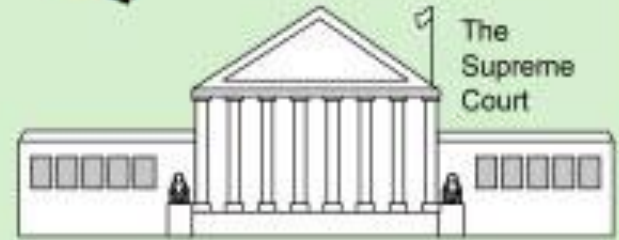
The Supreme Court