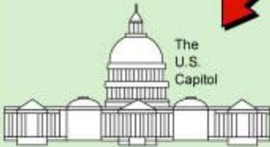
The U.S. Capitol