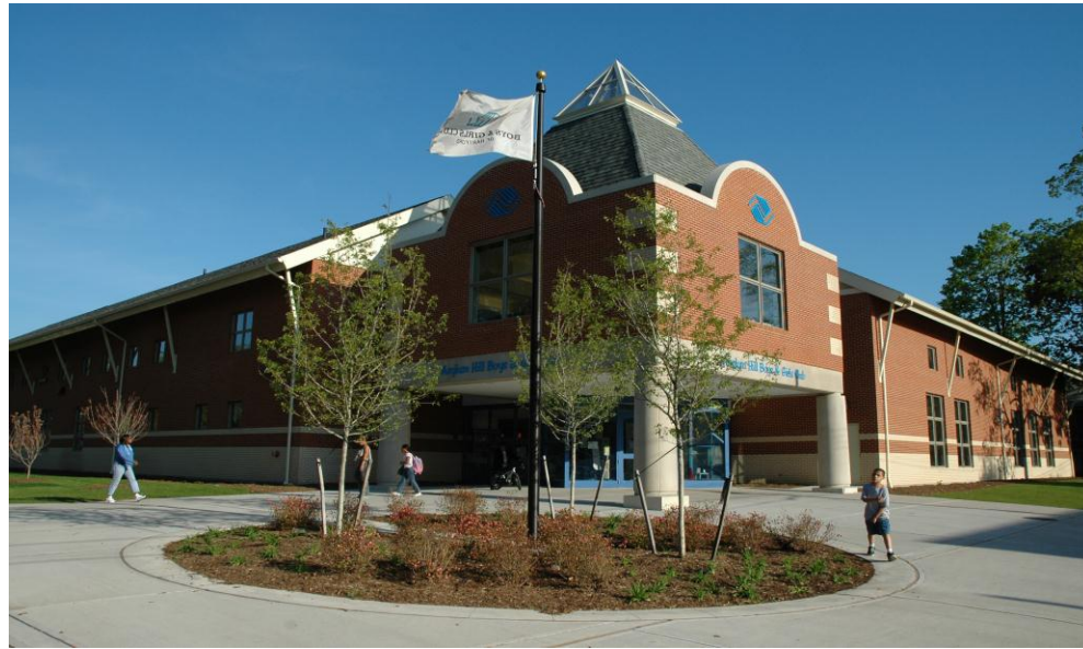
Asylum Hill Boys & Girls Club

This brochure produced by the COMMUNICATIONS Committee