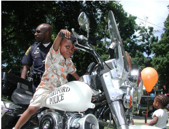
Sigourney Square Park

Committee works to improve relations between the police and fire depts. and the community, and to increase their effectiveness in Asylum Hill in order to establish a safer neighborhood for all its residents and visitors.