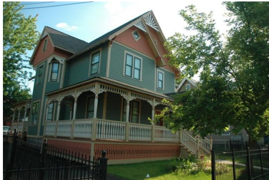
33 Sargeant St

La misión de "AHNA" es la de preservar y mejorar el vecindario de Asylum Hill a través de los esfuerzos de cooperación de los residentes y la de aquellos que tienen intereses en Asylum Hill, tales como dueños de negocios, empresas, dueños de propiedad y organizaciones culturales y sin fines de lucro. Todos se unen como voluntarios y trabajan por una causa común: la de mejora de Asylum Hill.