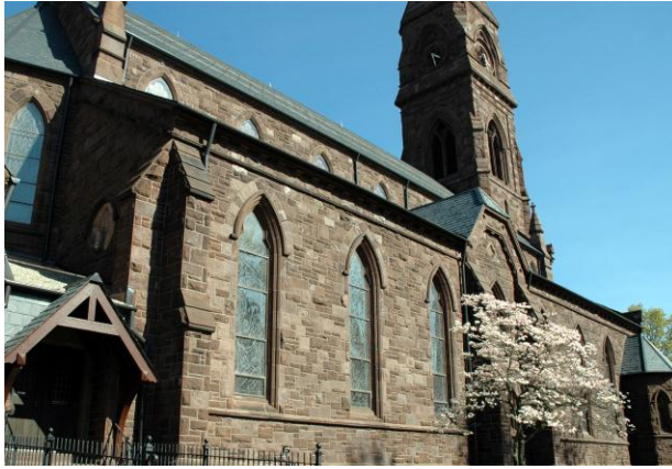
Asylum Hill Congregational Church

¿Qué es AHNA? La Asociación del Vecinos de Asylum Hill fue creada en el 1996 para planificar y poner en práctica estrategias de revitalización del vecindario.