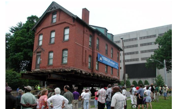
Victorian Home moved to 21 Ashley St

Committee works to improve all modes of transportation and to expand business and employment opportunities for Asylum Hill residents.