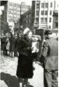
Giving to the Red Cross, 1945.