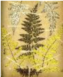
Botanical specimens in the City Parks Collection herbarium, c. 1900. City Parks Collection.