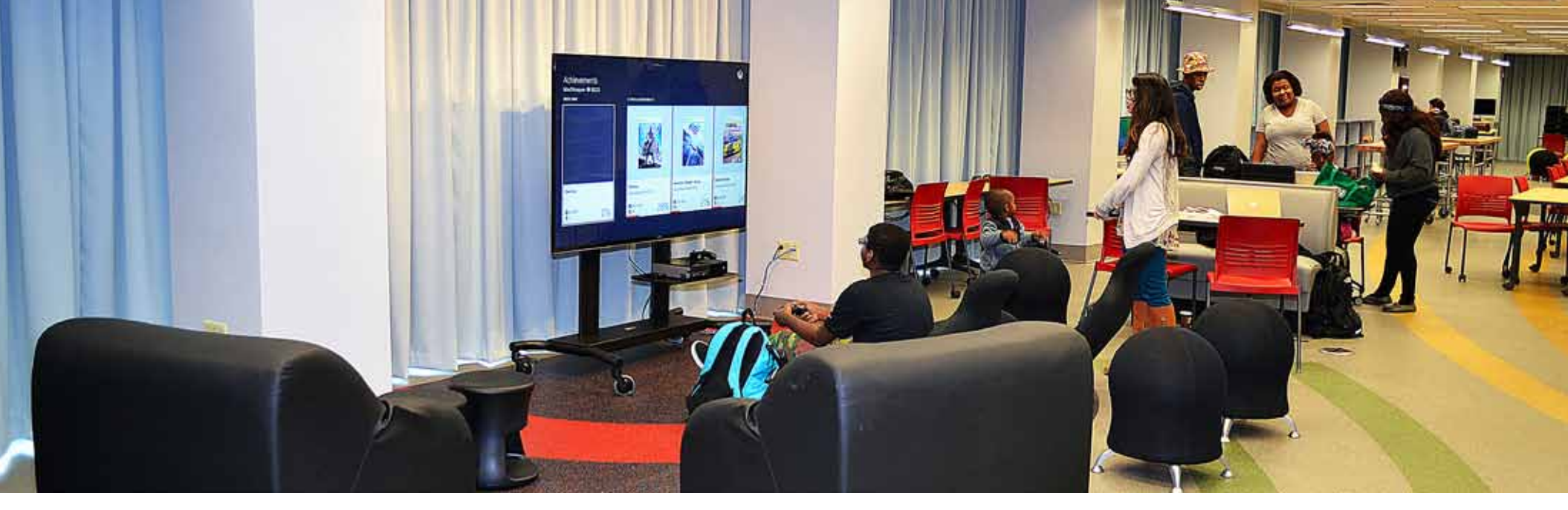
YOUMedia at Hartford Public Library is a creative learning environment open to teens to "hang out, mess around, and geek out."