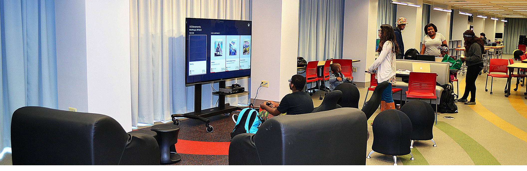
YOUMedia at Hartford Public Library is a creative learning environment open to teens to "hang out, mess around, and geek out."