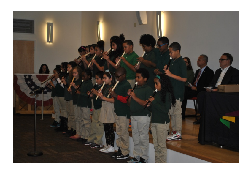
Batchelder Elementary School