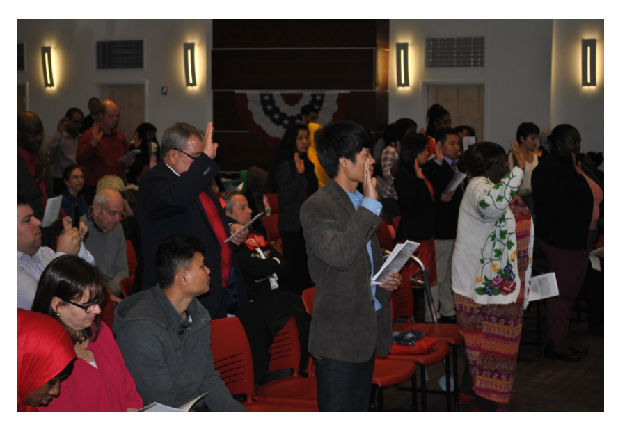
New citizens taking the Oath of Allegiance

The citizenship ceremony was also enriched by the participation of local Hartford youth.