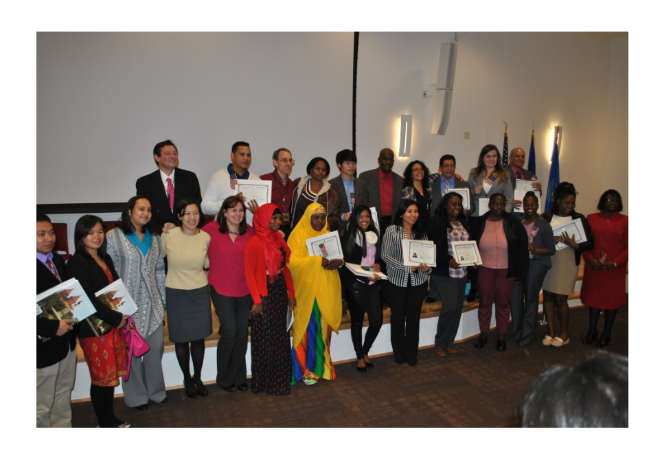
New U.S. citizens and HPL American Place staff celebrate citizenship!

home to 16 of these new citizens, all of whom benefitted from library services of English language and citizenship classes, application support, or intensive tutoring in preparation for the citizenship interview.