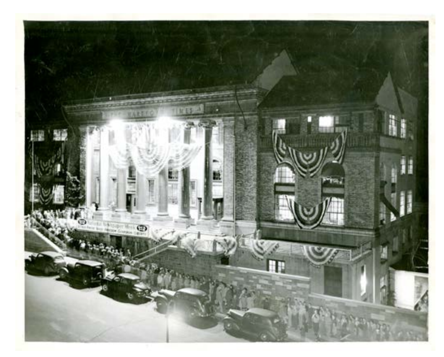
The Hartford Times Celebrates National Newspaper Week, 1946.

The Hartford Times exhibition will be part of ongoing tours for the UConn community as it gets ready to open its new campus.