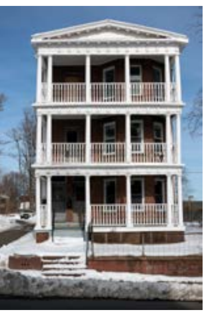
Top to bottom: Babcock Street, 2010; Florence Street, 2013; Cathen Street, 2014, Pablo Delano.