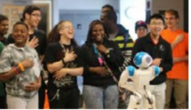
HPL file photos