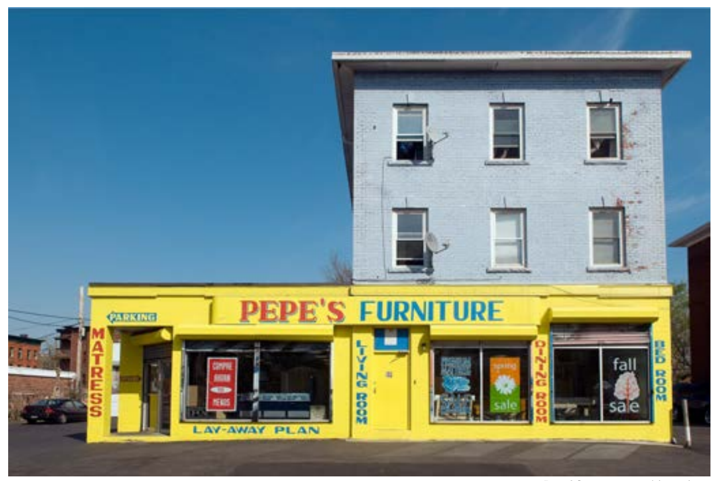
Broad Street, 2010.

The ArtWalk gallery on the third floor of the Downtown Library is an expansive space overlooking Hartford's Main Street. It is host to five juried shows each year and some shorter pop-up exhibits between shows.