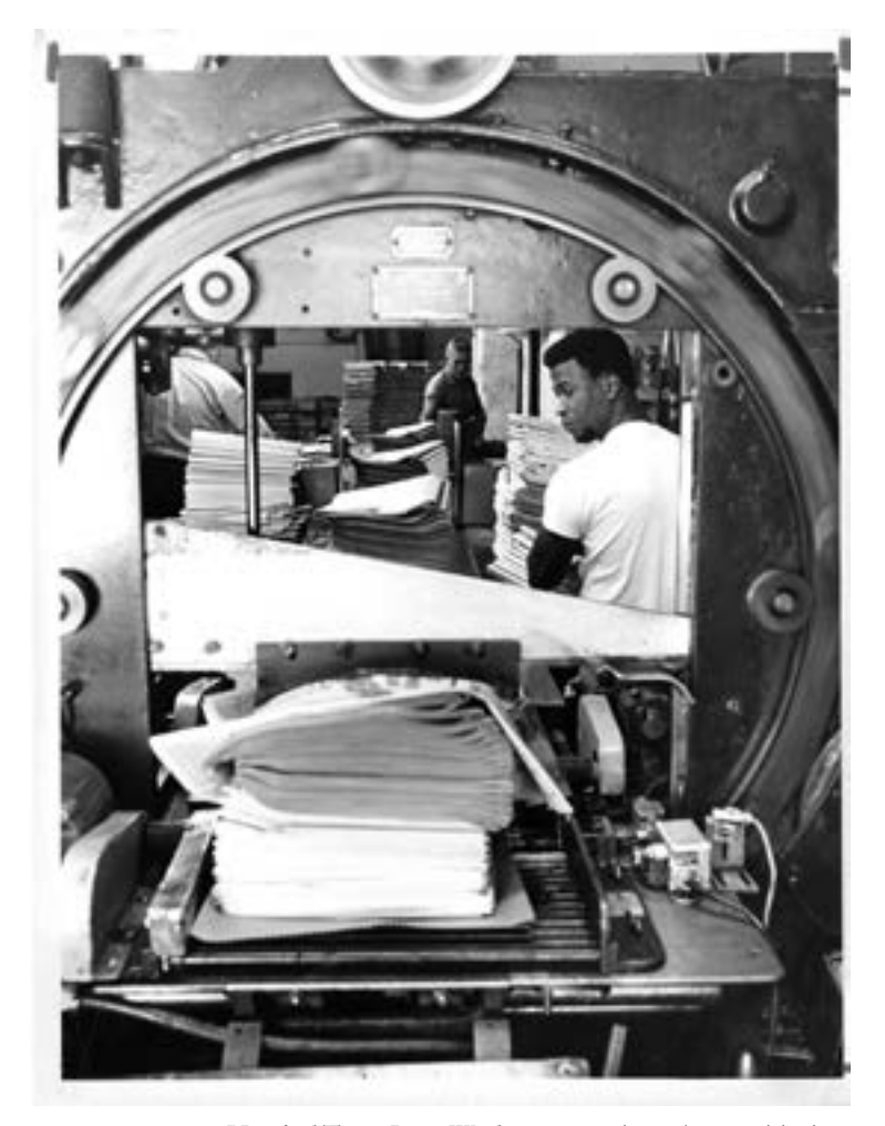
Hartford Times Press Worker, 1975.

"News is an immortal bubble and the press endures within."