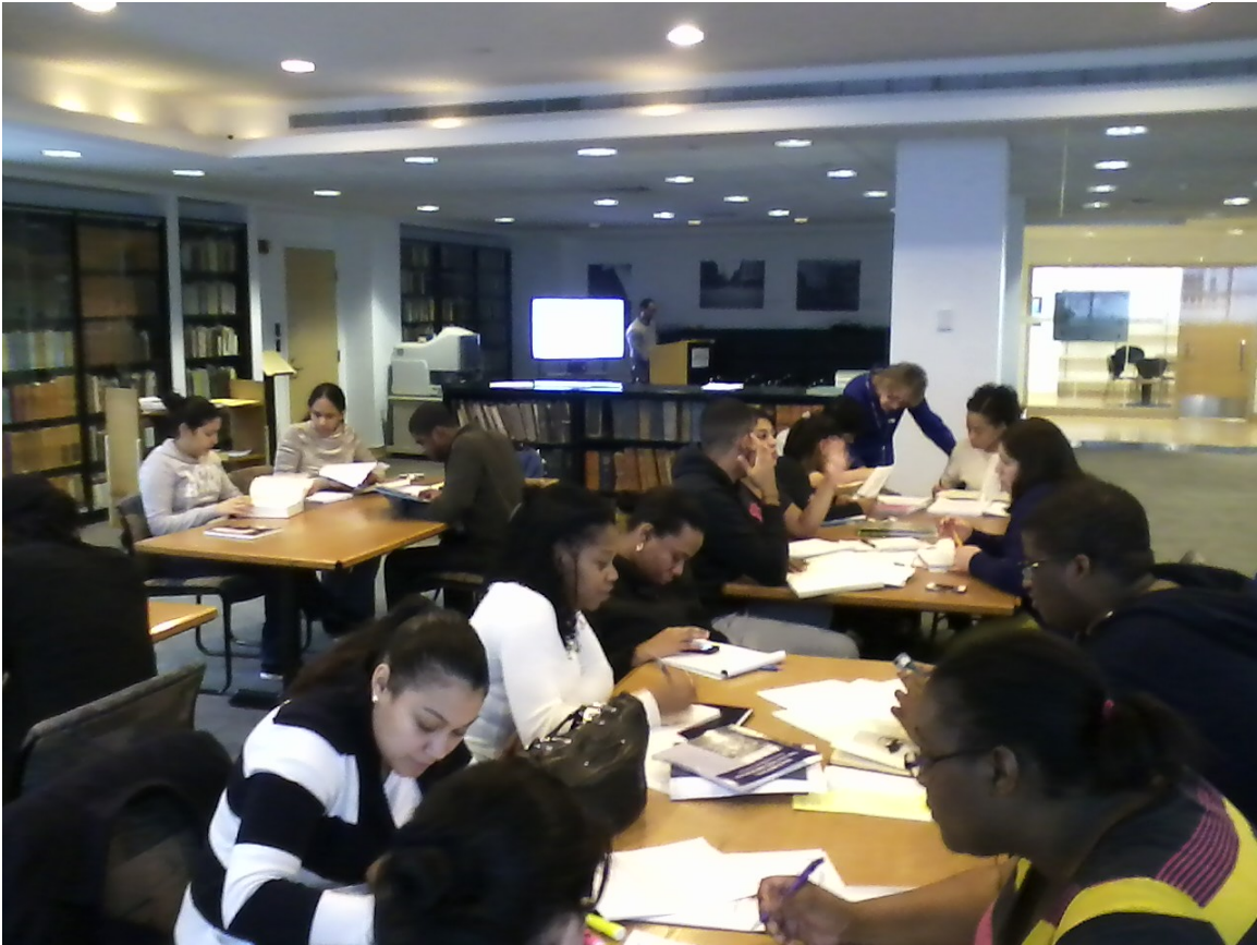
Capital Community College students conducting research in the Hartford History Center, Spring 2013

learning, and encourage individual exploration. To learn more about the library, please see www.hplct.org .