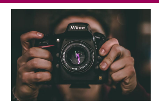
Photo Editing Workshop Every Friday, 4-5 pm Albany Library YOUmedia Center

HPL mentor and photographer Nygel hosts photo shoots every Friday at Albany